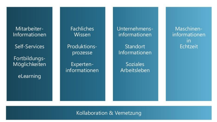
Image 1 Clivot (2015): What kind of information and tools does the production staff need?

The new arrangement of digital technics from decentralized applications or controls become more users friendly and create as deeper processwell a and contextual understanding and a kind of "netcompetence/Netzkompetenz" from the employees, which is more than necessary. Federal secretary for